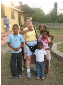
The Mission Reaches Out To The Children