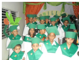
Deb's Little Angels Graduate

Isle of Faith has been sending groups of volunteers on the annual mission trip to the Dominican Republic since 2001. IOF has contributed to the creation and maintenance (including food, supplies & education) of Deb's Little Angels, a local orphanage serving almost 90 children.