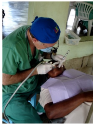
The Medical Mission provides dental care.

The Isle of Faith Dominican Republic Medical Mission has teamed up with Medical Ministry International (MMI), an interdenominational medical mission based in Allen, Texas. MMI is committed to meet the need for medical care among the world's poor with lasting solutions through excellence in medicine, eye care, dental care, patient care, health education and spiritual outreach.